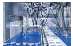
Robotic Automation Systems