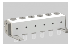
Air Purge Block