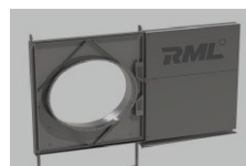
Duct Isolation Valves