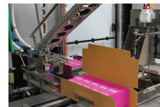
Case Packer Machines